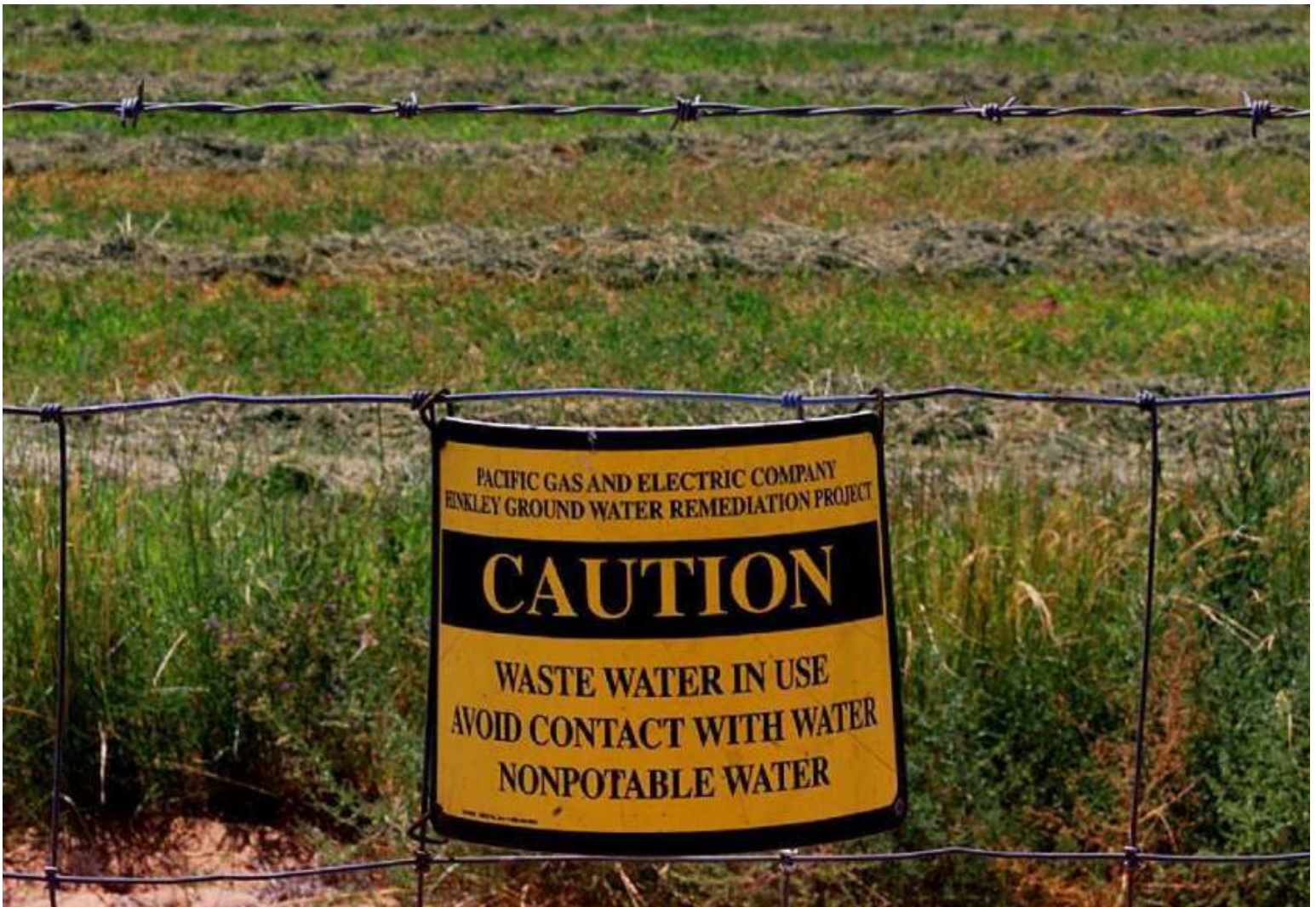
Caution signs hang on a fence surrounding a Hinkley, Calif., farm that uses irrigation water polluted with chromium, a